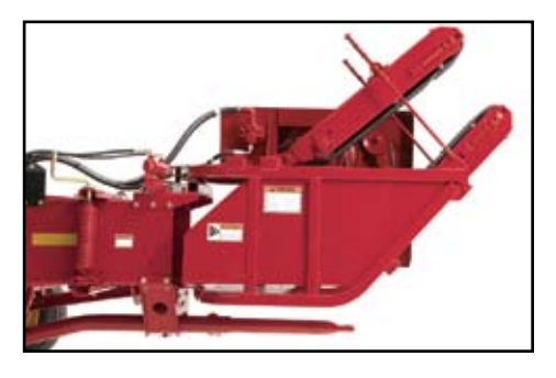
Bale thrower option lets the wagon fill along with the baler. Smooth, reliable hydraulic drive throws the bale.