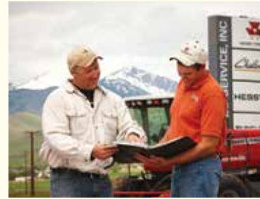
At Hesston, you're family. And there's nothing we wouldn't do for family.

Genuine AGCO replacement parts are manufactured to the same high standards of quality and dependability as the machine's original part, helping keep your Hesston by Massey Ferguson baler running like new.