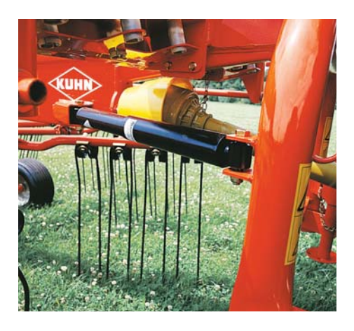
MOUNTED FLEXIBILITY WITH TRAILED PERFORMANCE

Most of Kuhn's mounted rotary rakes feature a pivoting headstock (GM models) and perform in the same way as a trailed machine when raking. Working while turning does not alter the raking quality or windrow shape. This allows you to make faster turns with complete safety and helps ensure faster, easier harvesting even in tight field corners.